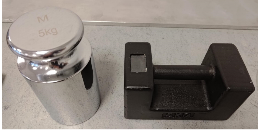
Figure 2: Reference weights used to calibrate the weighing scale. Left is from Gram Precision , right is from AE Adam .