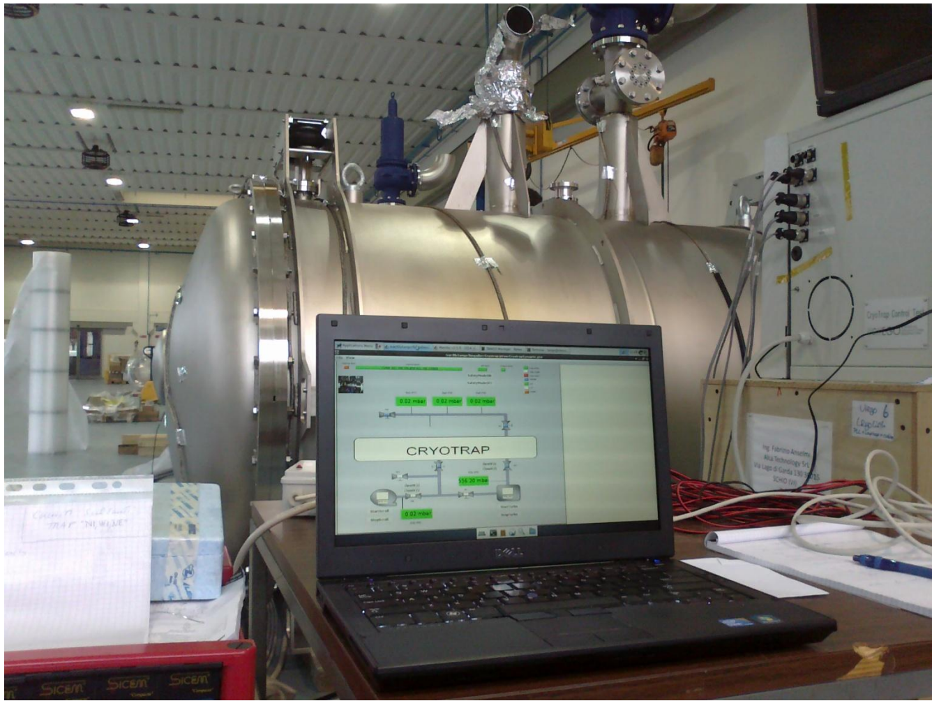
Figure 2: Synoptic used to Control the cryotrap

A TANGO test server was used to open/close valves and switch on/off pumps monitor gauges etc....A TANGO synoptic (gui) was developed to control this server and all values were archived to a Mysql database every 10 seconds using TANGO's mambo tool. This test software is described in ref1. <u>https://tds.ego-gw.it/ql/?c=9045</u>